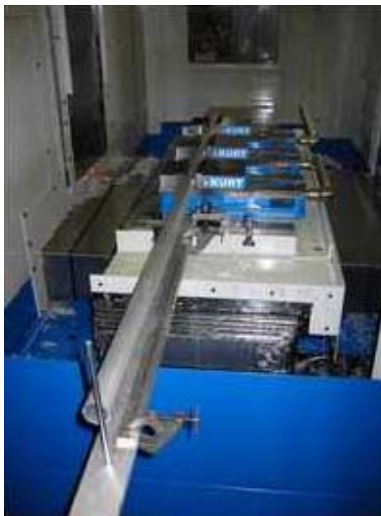
6' long truss tube milling set