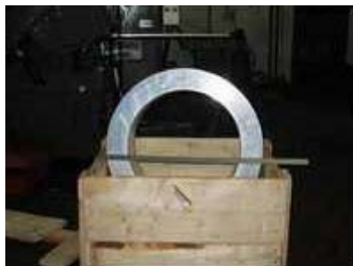
One of the centrifugal castings