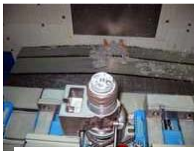
Milling the knobs

Here is my parts list. It doesn't include things like the bicycle seatpost clamp handles that were given to me. These are the parts that I designed and made for the project.