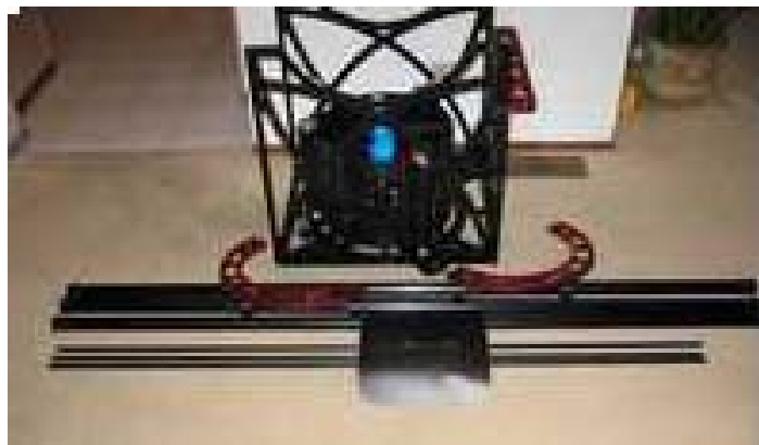
Disassembled on carpet

The problem with making your own telescope is that you don't have that familiar white booklet with nice drawings and instructions when it comes time to put the thing together. Even though I designed and made this scope it took me over a day to do the initial assembly. I had to figure out a logical order to put it together. Subsequent assembly is a breeze. It takes about 5 minutes to put it together for viewing. I remove the three wingnuts and locating plugs from the upper cage. Remove the upper and lower cages from the transportation position inside the rocker box. Unscrew the bolts and remove three more plugs. I then place the tubes in position inside the bores of the lower cage. Place the upper cage on the three poles. Lock 12 clamps on the cages. Pick the assembly up and put it on the rocker box. Install the light shield and Telrad. Screw in the brake screw. Remove the mirror covers. Install an EP and I'm viewing!