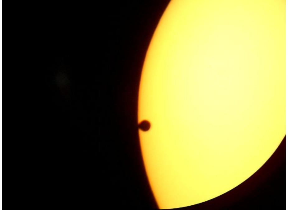
Venus tear drop

You may have read about a strange phenomenon that happens when the planet makes third contact (the point when the edge of the planet first touches the edge of the visible sun on its move out of the sun. I believe this phenomenon is due to refraction but I would have to go back and review past articles