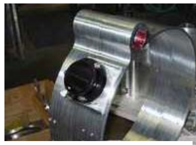
Focuser adapter and focuser