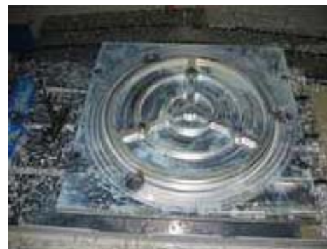
Mercedes Plate Tailgate

Total time spent programming, setting up and machining was around 180 hours.