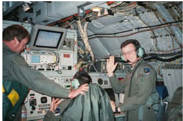
Air Force crew

minutes right away. It is a good thing there was not a bigger group on the flux measurement team, because not one of us wanted to relinquish our goggles! We didn't want to take any eye breaks and miss any of the action! At about 00:45 November 19th the rates began to rise dramatically. Last night's ZHR of 15 soon became 50. Our intensive image cameras allowed us to see meteors down to 7th or 8th magnitude, lower than a normal person in a dark sky could see with a naked eye, so our "clicks" on the mouse were statistically adjusted. Leonids increased ten-fold every 10 minutes. Soon we were seeing multiple meteors in our goggles. They appear to stream down in clumps. Some seconds there were none, other seconds there were 5 to 15 in our field of view at the same time. The pauses between the "clumps" was dramatic! There were more faint magnitude 5 thru 7 meteors during the peak of the storm.