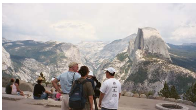
Visitors at Glacier Point looking through telescope to see mountain climbers on flat face