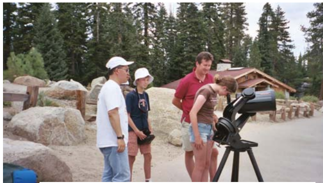
Glacier Point visitor uses 8-inch telescope