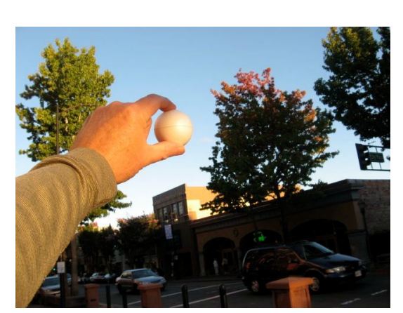
Angie & Ken

Oh yes, we were offered hot pizza as well, which we graciously accepted. &-)