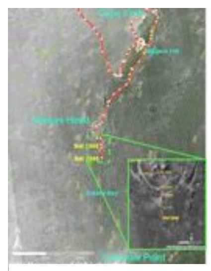
A map of Opportunity's planned traverse from Cape York to Solander Point. Larger image

After nine-plus years of traveling, Opportunity recently set the US space program's all-time record for mileage on another planet. The milestone occurred on May 15, 2013, when the rover drove 80 meters, bringing its total odometry 35.760 kilometers or 22.220 miles.