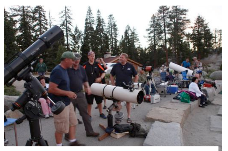
Waiting for dark