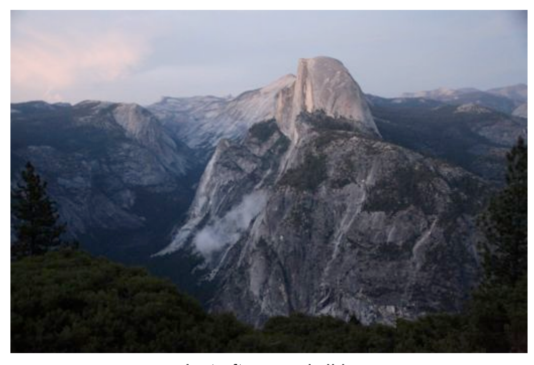
Just after a rockslide