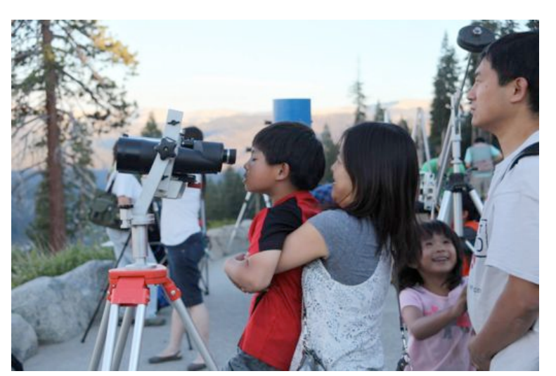
Visitors checking out Half Dome