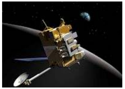
Click to visit the LRO home page

years old in the case of Ina. The steep slopes leading down from the smooth rock layers to the rough terrain are consistent with the young age estimates.