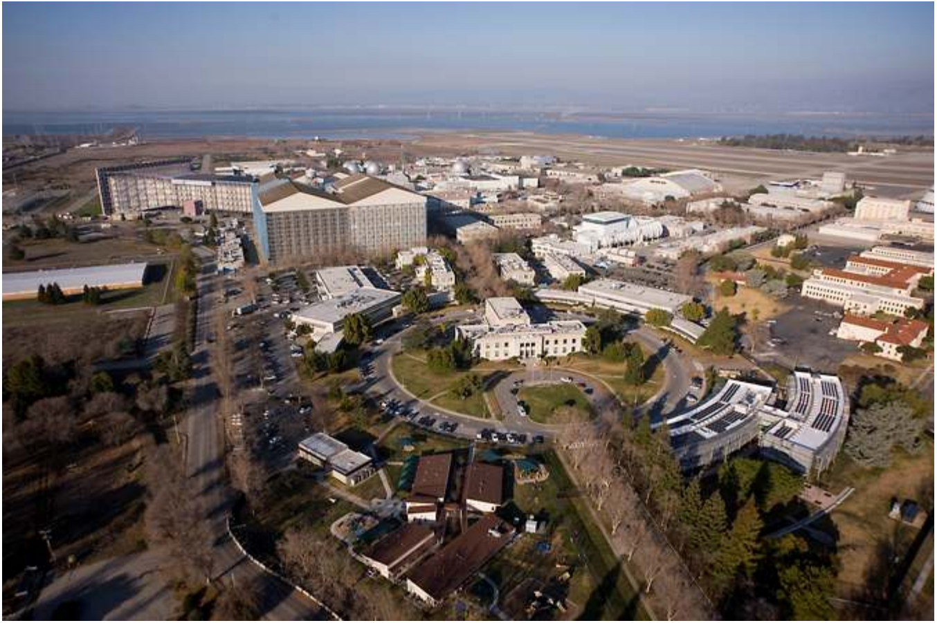
An aerial photo of NASA's Ames Research Center.